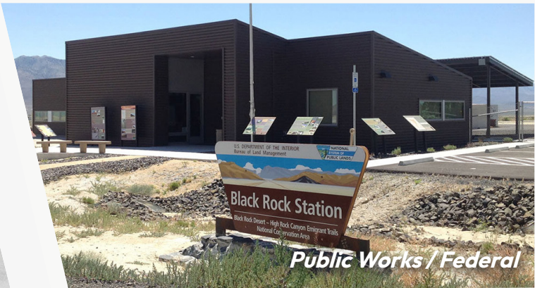
Public Works / Federal