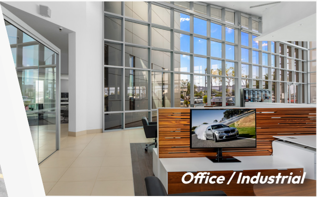
Office / Industrial